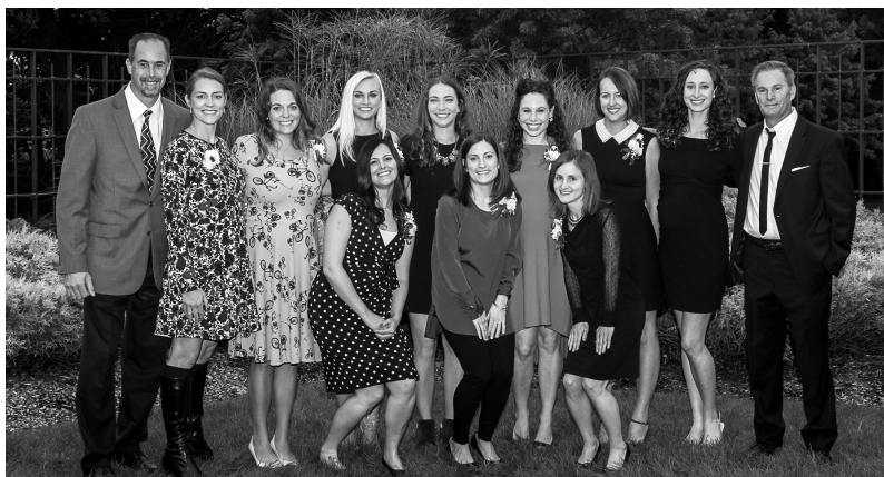
The Perry High School 2001 Girls Cross Country Team